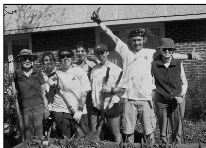
CU students gardened with residents at Frasier Meadows Retirement Community.

Volunteer Connection's 5 th Annual I Volunteer! Day on April 19 th was a huge success! Nearly 600 volunteers turned out on a beautiful Saturday morning to give something back to their communities. Enthusiastic volunteers completed projects for 33 non-